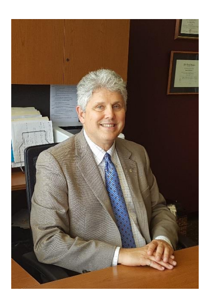
Greetings from Sauk Valley Community College!

Whether you are a student, employee or visitor, Sauk Valley Community College takes your security and safety seriously. SVCC has trained security staff on-campus 24 hours a day, seven days a week. Additionally, SVCC security works closely with Lee County Sheriff's Department and the Illinois State Police to ensure the safest campus environment possible. An Emergency Preparedness Committee regularly meets to discuss and improve Sauk's emergency procedures, and all of Sauk's employees are trained to initiate those procedures. While being trained for every emergency situation is not possible, Sauk will always do its best to respond quickly and professionally to any emergency situation.